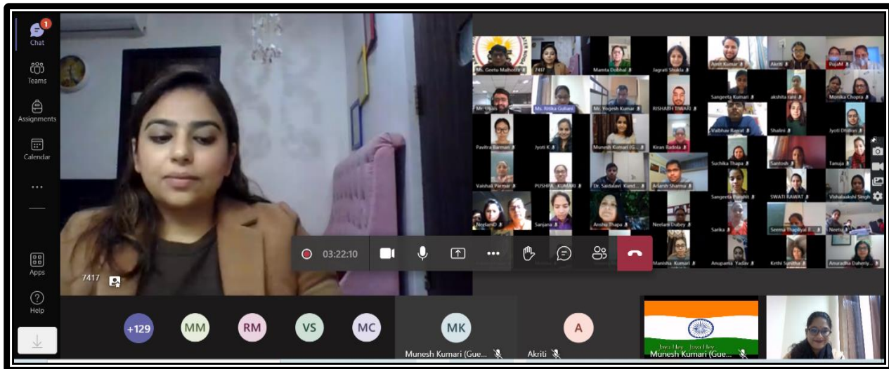
Participants from various organization attending the workshop.